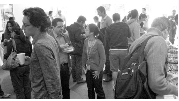
Lunch at Ne(w)roscience.

The symposium was devised as a networking opportunity for young, independent researchers (1-8 years of establishing their own research team), as well as to provide an opportunity